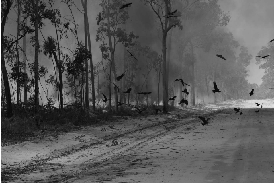
Figure 1. Black Kites at bushfire in Queensland.

typically describe the behavior as intentional, but others who have heard of fire-spreading often believe it to be accidental 2 . We characterize local ecological knowledge of fire-spreading as follows. Raptors fly into active fires to pick up smoldering sticks in talons or beaks, transporting them up to a kilometer away and dropping them either in brush or in grass. Sticks may be from human cooking fires or from burning or smoldering vegetation. The imputed intent of raptors is to spread fire to unburned locations—for example, the far side of a watercourse, road, or artificial break created by firefighters—to flush out prey via flames or smoke. The behavior may occur once or repeatedly during the fire, by a single bird or by a small percentage of the overall raptors present. Attempts may be unsuccessful, with burning sticks dropped short of unburned areas or dropped but not igniting vegetation.